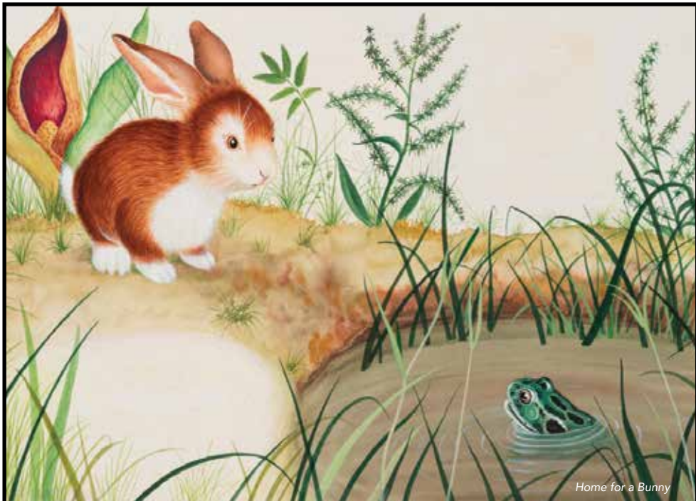
Home for a Bunny