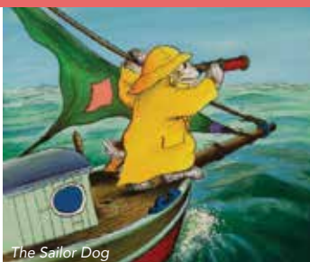
The Sailor Dog

Organized and toured by the National Center for Children's Illustrated Literature in Abilene, TX, this exhibition presents original work from 28 of Garth Williams' most beloved books, including Charlotte's Web , The Little House on the Prairie and a number Little Golden Books.