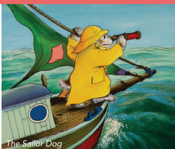
The Sailor Dog

Free guided gallery tours are offered every Thursday @ 6:30 p.m. and every Sunday @ 2:30 p.m. Call 972.252.7558 for more information.