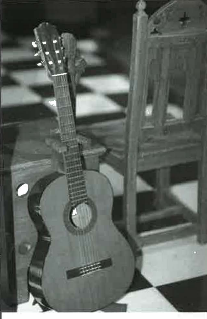
Expertise & Professionalism When It Counts