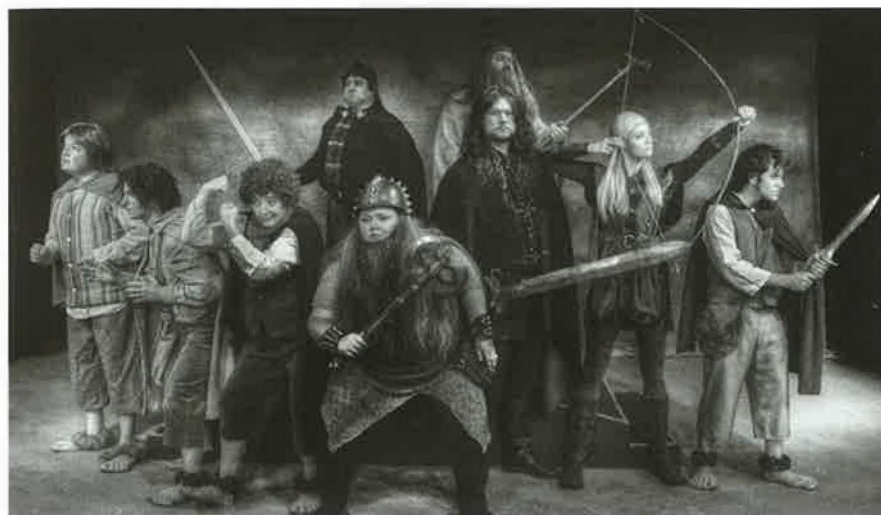
ABOVE: The Circle Theatre cast of Fellowship! A Musical Parody of The Fellowship of the Ring

Based on the literature of J.R.R. Tolkien and produced with permission of The Saul Zaentz Company d/b/a Middle-earth Enterprises, Berkley, CA. "The Lord of the Rings", "The Fellowship of the Ring", "The Two Towers", "The Return of the King" and the characters and places therein are trademarks or registered trademarks of the Saul Zaentz Company d/b/a Middle-earth Enterprises. Based on the 2014 production at Circle Theatre, Ft. Worth.