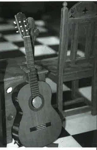
Expertise & Professionalism When It Counts