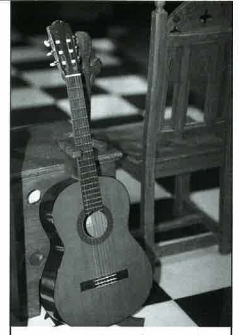
Expertise & Professionalism When It Counts