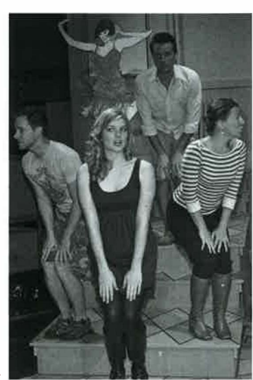
The cast of [title of show] rehearses the show.

In the uproarious tradition of backstage musicals, this 2006 Off-Broadway hit follows two theater geeks as they try to pursue their idea of happiness: create a really great musical just in time to make the deadline for a theater festival. The songwriting team considers all sorts of fabulous ideas as they try to cobble together this last minute production, discovering all of the hilarious backstage drama of putting on a show.