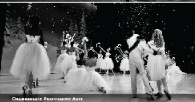
CHAMBERLAIN PERFORMING ARTS