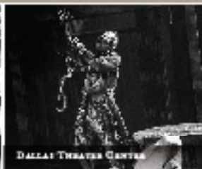
DALLAS THEATRE CENTER