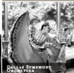
DALLAS SYMPHONY ORCHESTRA