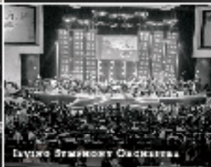
LIVING SYMPHONY ORCHESTRA