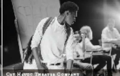
CAT HAYDO THEATER COMPANY