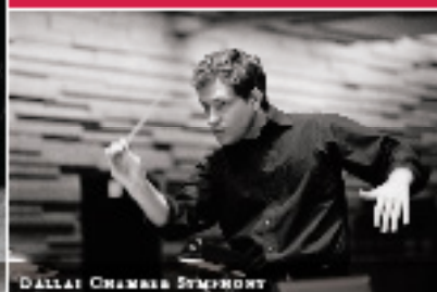
DALLAS CHAMBER SYMPHONY

I BELIEVE CREATIVITY IS THE VERY ESSENCE OF LIFE. IT WHITES US, INSPIRES US, CHALLENGES AND CHANGES US.