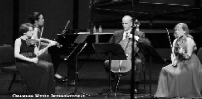
CHAMBER MUSIC INTERNATIONAL