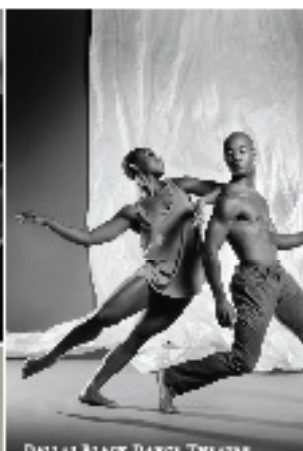
DALLAS BLACK DANCE THEATRE