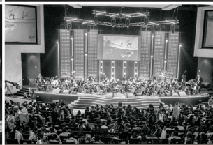
IRVING SYMPHONY ORCHESTRA