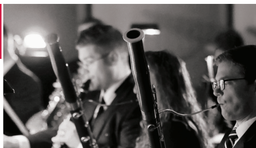
DALLAS CHAMBER SYMPHONY