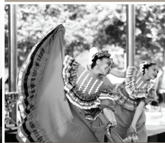
DALLAS SYMPHONY ORCHESTRA