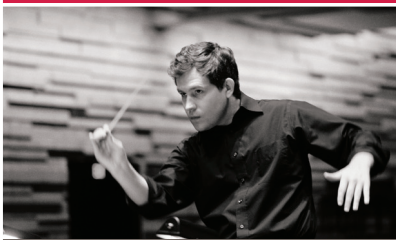
DALLAS CHAMBER SYMPHONY

I BELIEVE CREATIVITY IS THE VERY ESSENCE OF LIFE. IT UNITES US, INSPIRES US, CHALLENGES AND CHANGES US.