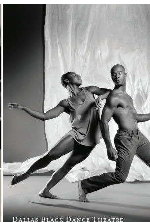
DALLAS BLACK DANCE THEATRE