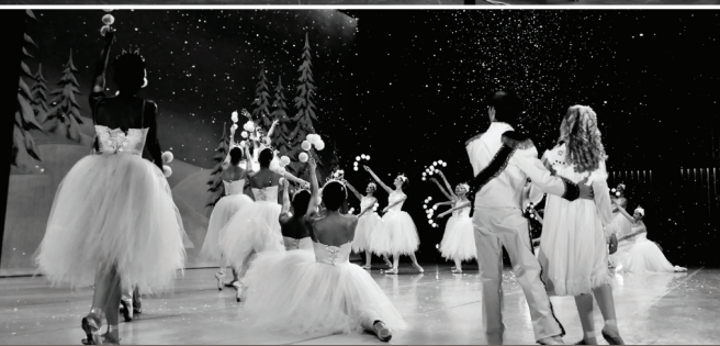
CHAMBERLAIN PERFORMING ARTS