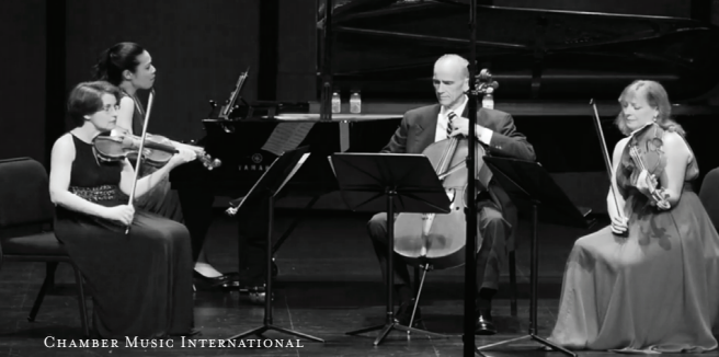
CHAMBER MUSIC INTERNATIONAL