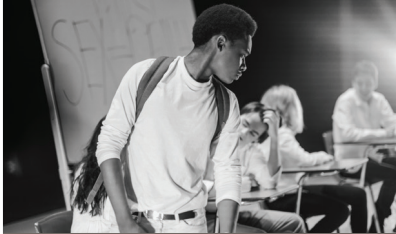
CRY HAVOC THEATER COMPANY