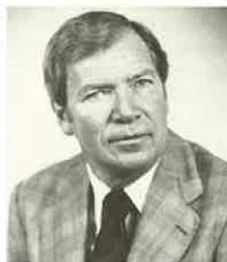
Sard Fleeker Doc