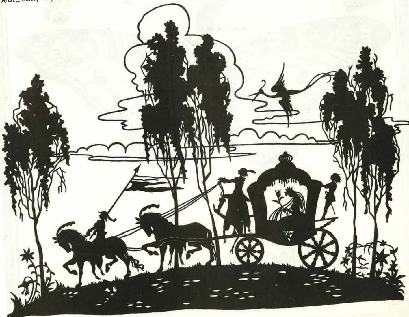
Arriving at Theatre Three next ... LARRY O'DWYER in Moliere's most perfect farce, "Tartuffe"