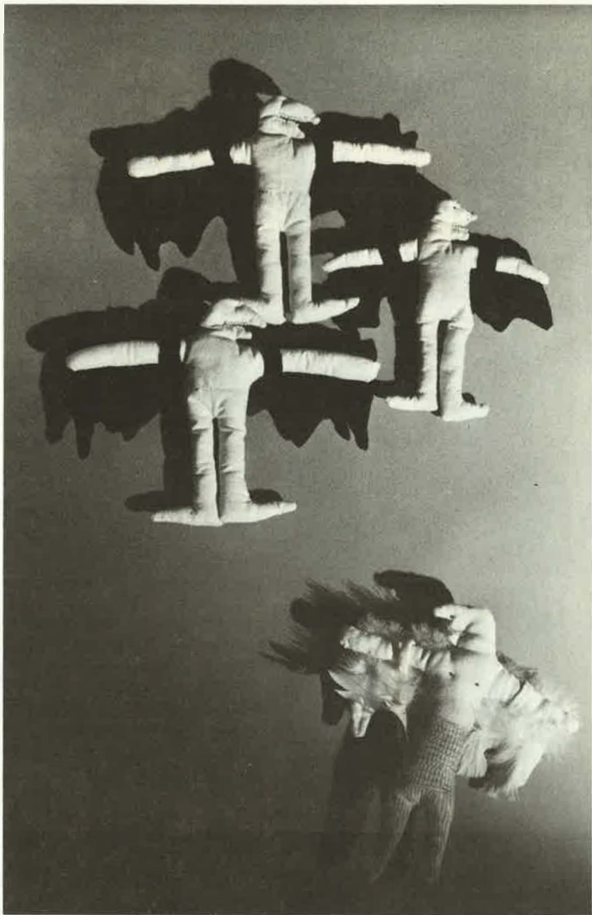
Soft Sculpture: Barbara Glazer