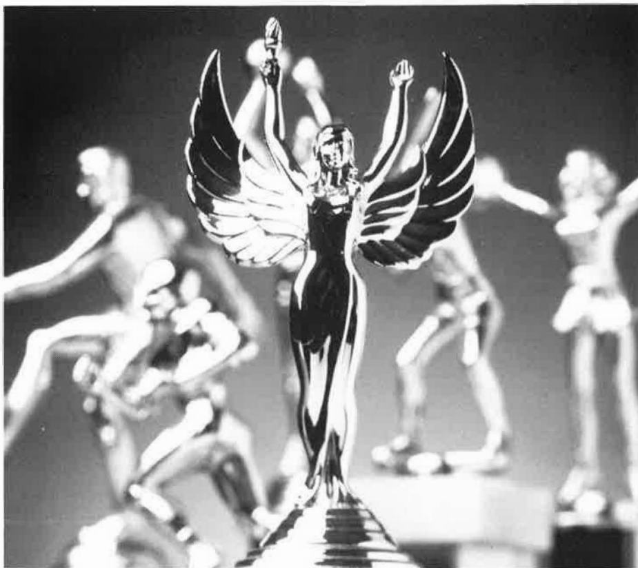
The Oscar Statuette is the property of the Academy of Motion Picture Arts and Sciences, Inc.