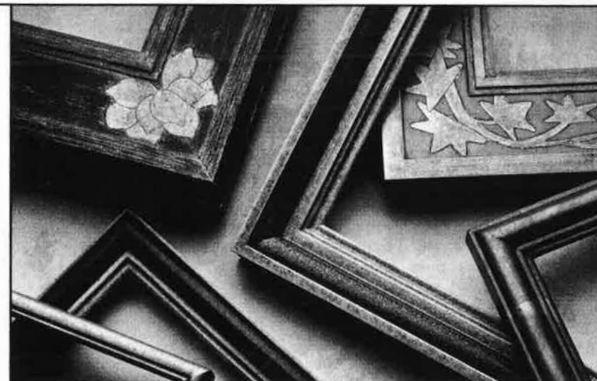
Hand finished and gilded picture frames, installation and conservation services.