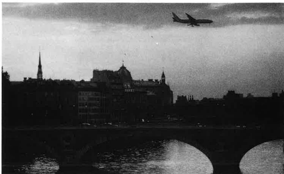
Pont Louis Philippe, Paris.